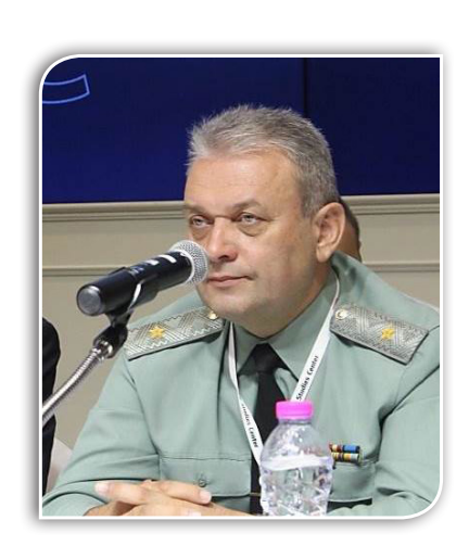
Maj.Gen. Suvorov Vladimir Leonidovich (Russia)