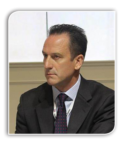
Commodore Rhett Hatcher (United Kingdom)